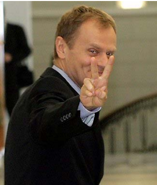
New Polish Prime Minister Donald Tusk

“Massive win for Polish opposition”, “Restoring hope”, “Chance for the new beginning”, “Free Poles comes back to Europe”, “Change in political direction in Poland” these are the headlines of most of the European newspapers on 22 October 2007 after the Civic Platform won the parliamentary election in Poland. This free-market, pro-European party with roots in “Solidarnosc” movement came in first in front of the Kaczynski’s brother Law and Justice party. The expectations of Poles and their friends in Europe with regard to the new government led by Donald Tusk and especially their foreign policy are very high. They must restore the trust and confidence of all the partners in the EU and pro-actively get involved in all the new and old European initiatives.