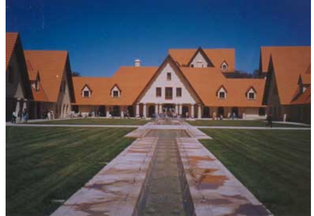
Al Akhawayn University Ifrane

During the workshop the preliminary results of GO-EuroMed 2nd stage research were discussed. The consortium also worked on further developing the project's overall message, tailoring all working papers within the political economy approach. Finally, the consortium also worked on its strategy for disseminating its results, planning PALMs and conferences for the remainder of the project. All partners agreed on strengthening communication with the national delegations of the European Union in their countries. The workshop concluded with a visit to the ancient city of Fes.